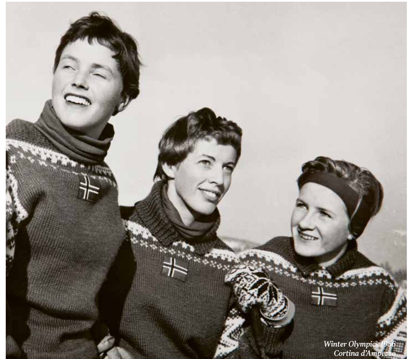
Winter Olympics 1956 Cortina d'Ampezzo