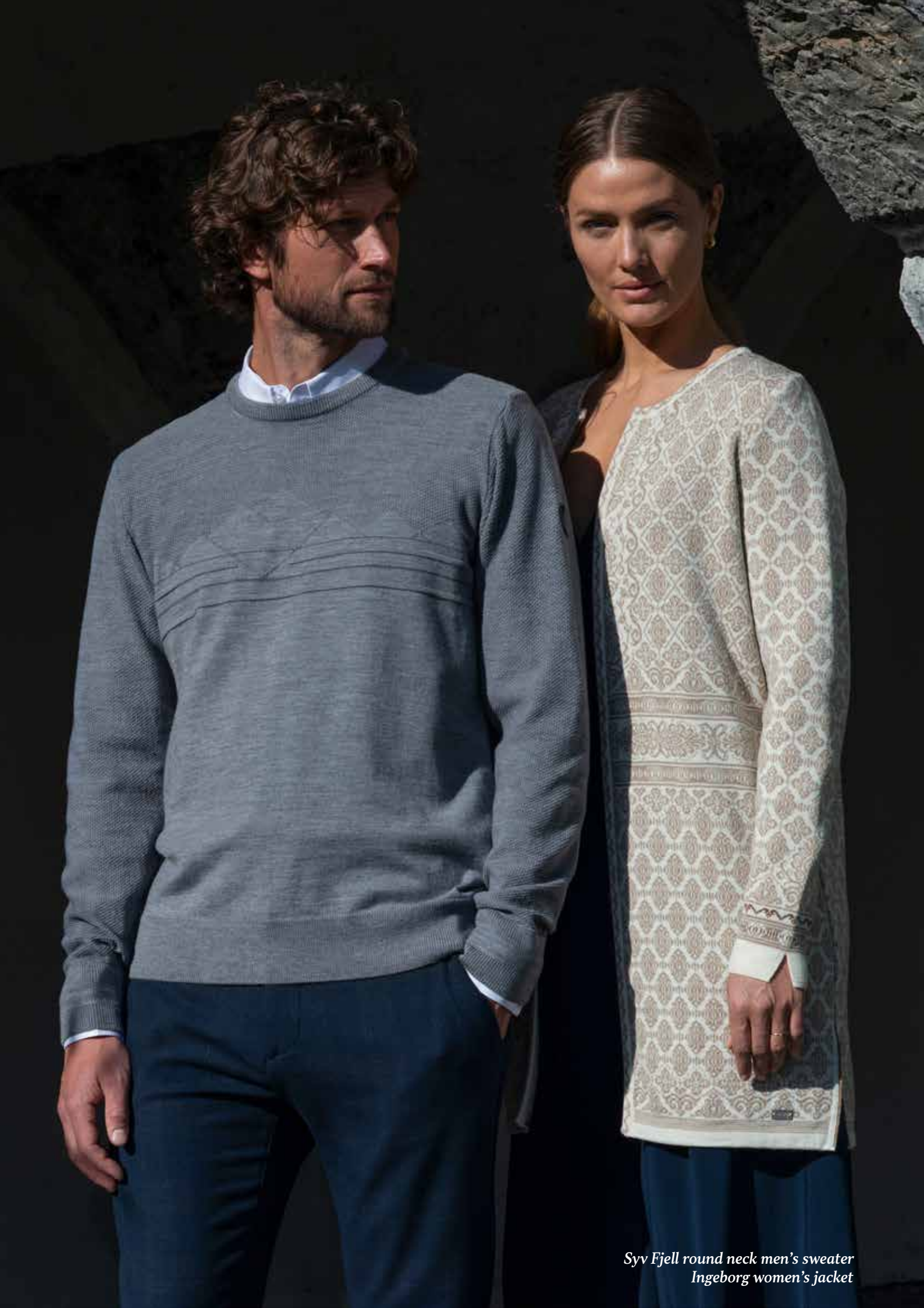
Syv Fjell round neck men's sweater Ingeborg women's jacket