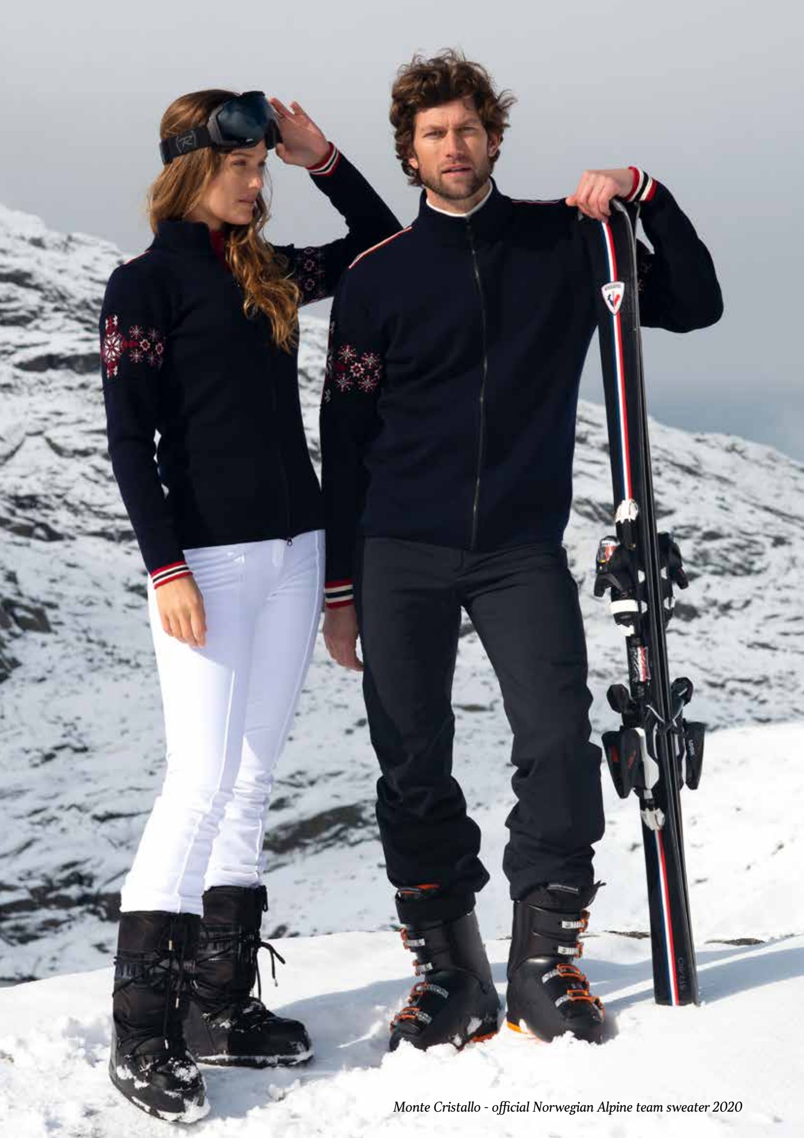
Monte Cristallo - official Norwegian Alpine team sweater 2020