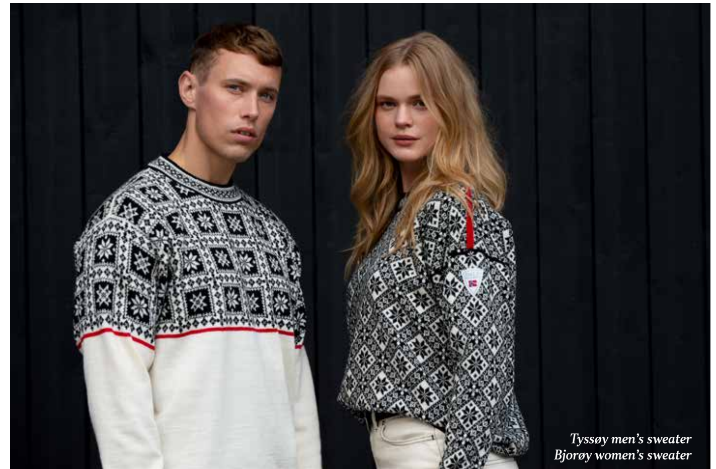
Tyssøy men's sweater Bjorøy women's sweater