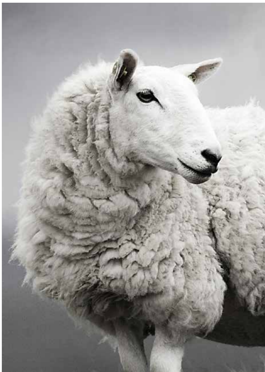
You cannot judge a book by its cover, but you certainly can judge a sheep by its wool.