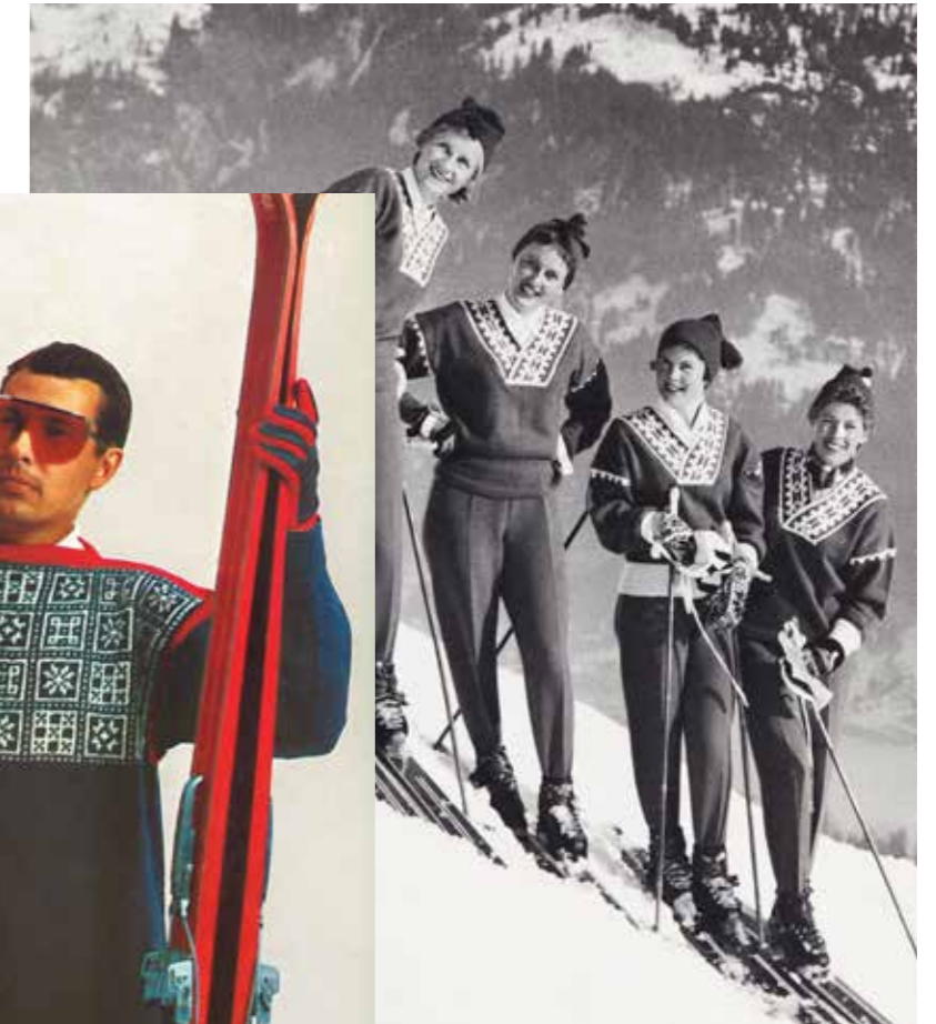
▲ 1958 Alpine World Ski Championships, Bad Gastein ◀ 1964 Winter Olympic Games, Innsbruck

Being the official supplier to the National Norwegian Ski Association, and later to the International Olympic Committee, we have designed official sweaters for every Winter Olympic and World Ski Championship event since the 1956 Cortina Winter Olympics. How about that?